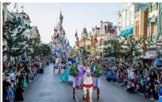
EURO DISNEY PARK