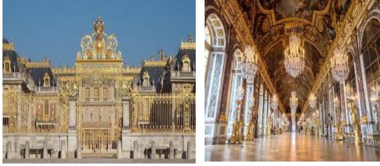
Palace of Versailles