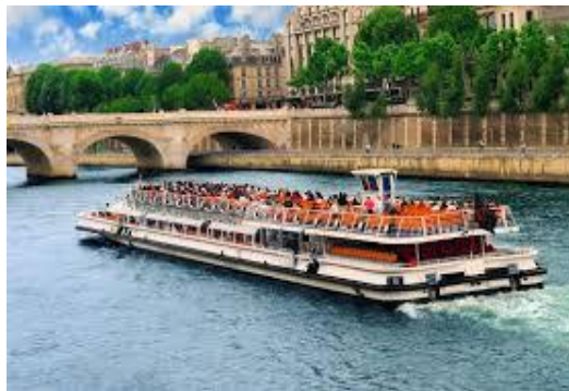
Jal Yatra Seine River Cruise - Paris

Day 03: Jal Yatra on Seine River Cruise at Paris - Evening Welcome Assembly.