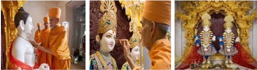
Murti Prathistha - Pran Prathistha of Lord Swaminarayan & Akshar Purshottam Maharaj

Maharaj - The sixth and current spiritual successor of Bhagwan ( Lord ) Swaminarayan.