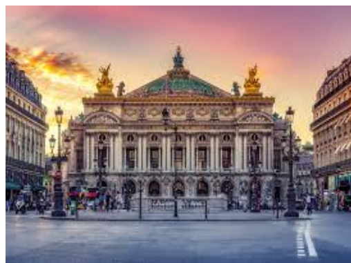
Opera de Garnier